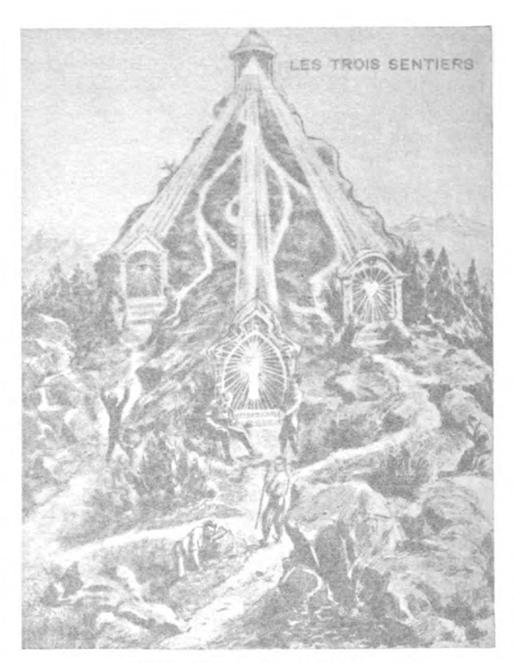
THE THREE PATHS.