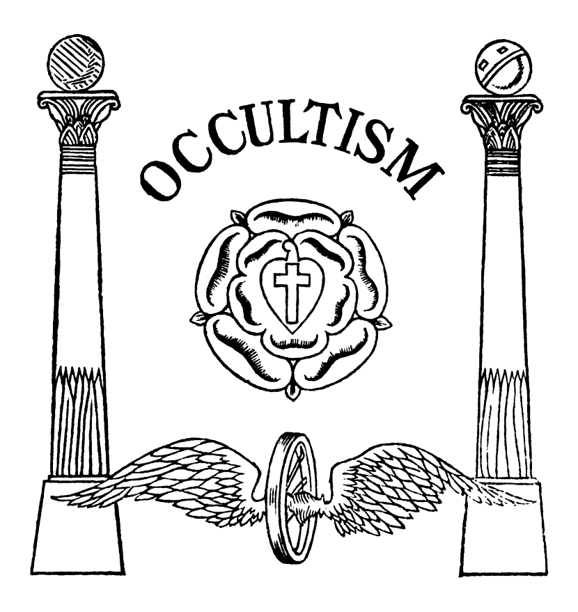
THE MAGIC OF THE CHRISTIAN CHURCH